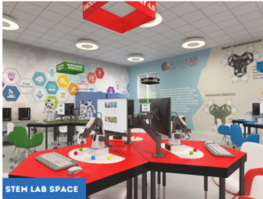
STEM LAB SPACE