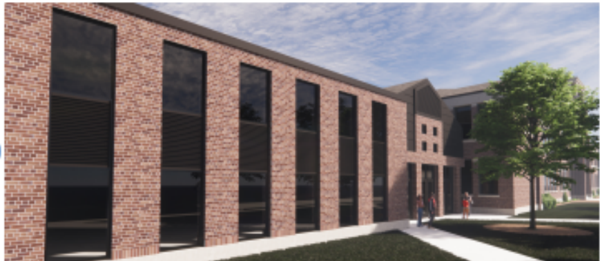
WILSON MIDDLE SCHOOL - ADDITION