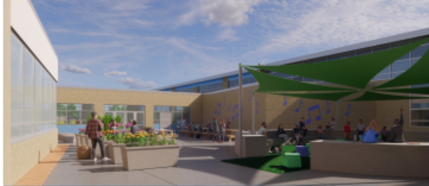
MADISON MIDDLE SCHOOL - NEW OUTDOOR CLASSROOM