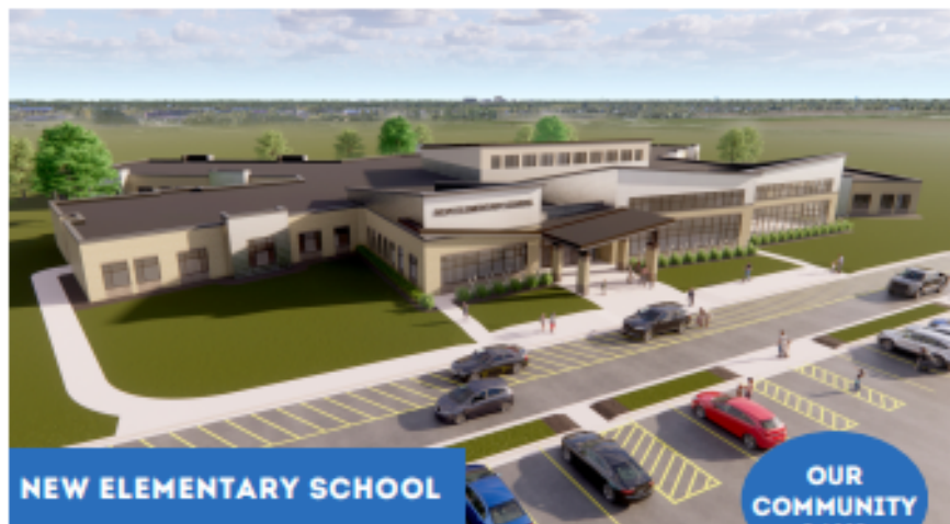
NEW ELEMENTARY SCHOOL