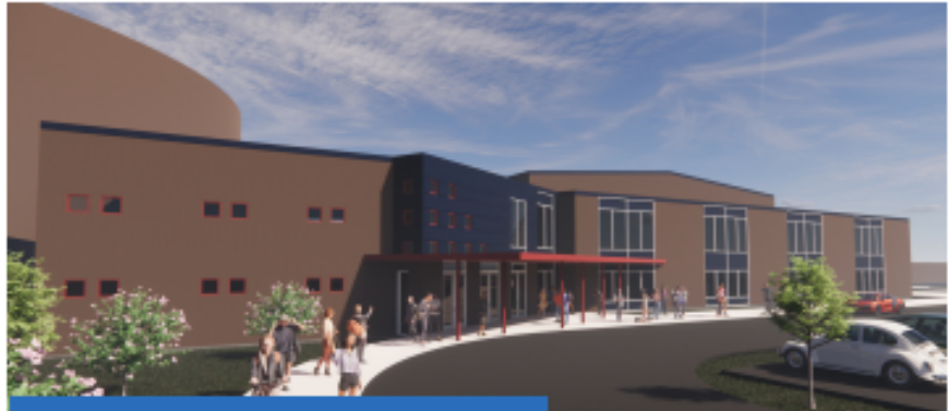
EAST HIGH SCHOOL - ADDITION